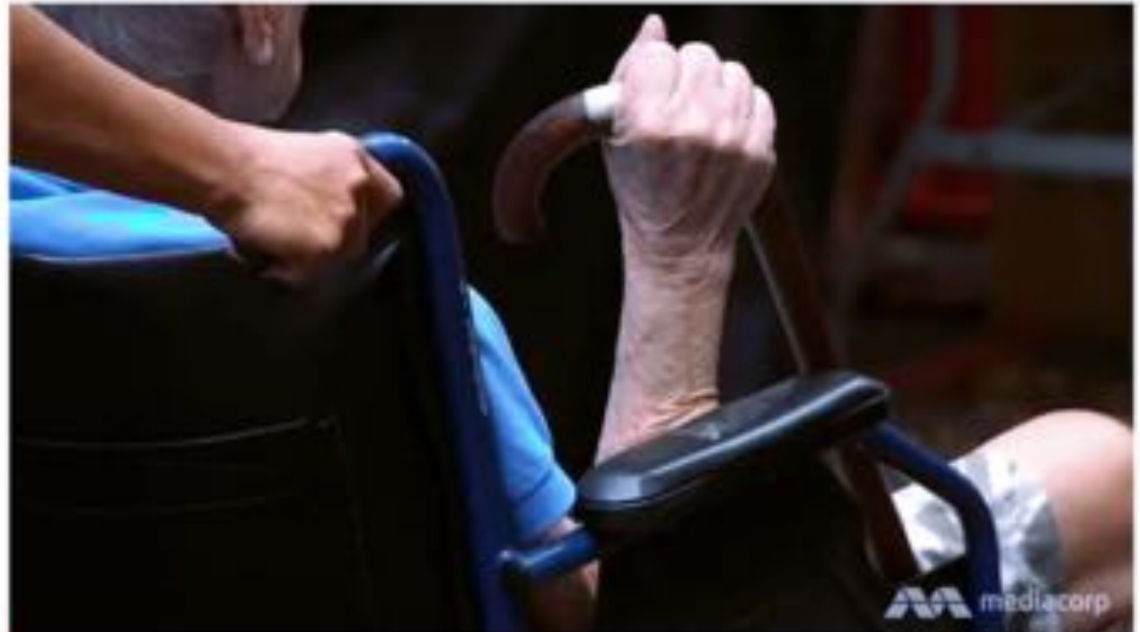
An elderly man in a wheelchair.