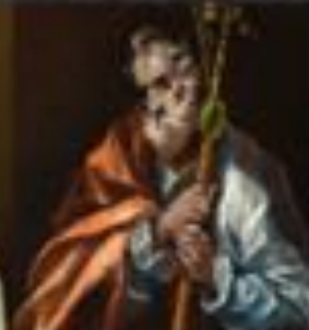
ST. JUDE THADDEUS