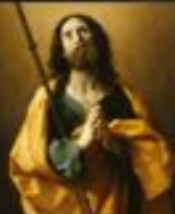
ST. JAMES THE GREATER