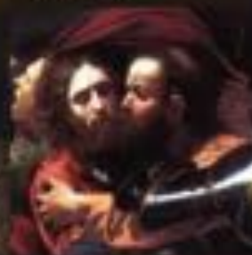
JUDAS ISCARIOT THE TRAITOR