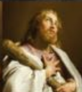
ST. JAMES THE LESSER