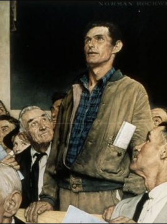
Freedom Of Speech