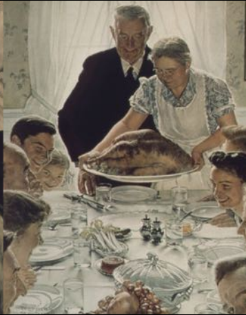
Freedom From Want