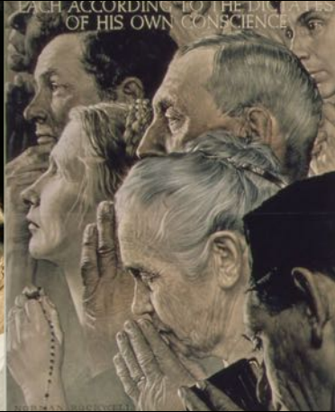
Freedom Of Worship