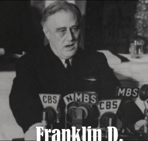
Franklin D. Roosevelt U.S. President