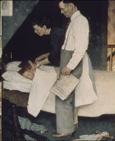
Freedom From Fear